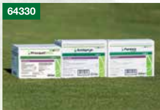
64330 ABW Solution