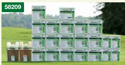
58209 Fairway Action Solution