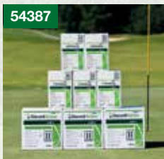
54387 A 2 Z Solution

Commitment Period: In order to be eligible for the prices and terms for the products described in this Pallet Offer, golf courses and professional applicators must commit to purchasing any of the Golf Pallets described below from a Syngenta Authorized Agent/Retailer between October 1, 2018 and December 7, 2018.