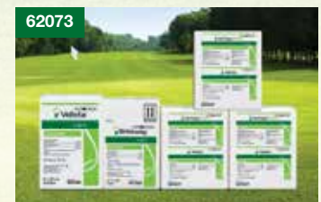
62073 Fairy Ring Solution