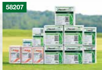
58207 All Season Solution