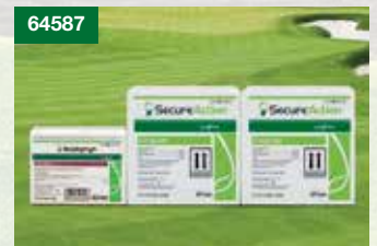
64587 Fairway Action Protector Solution