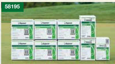
58195 Greens Systemic Solution