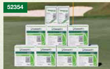
52354 Snow Mold Solution