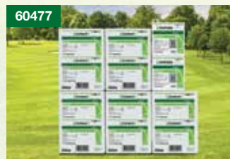
60477 Contend Winter Solution