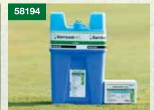
58194 Warm Season Herbicide Solution