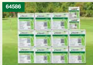
64586 Dollar Spot Solution