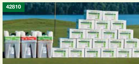
42810 Fairway Starter Solution