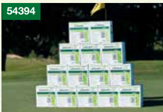
54394 Contact Solution