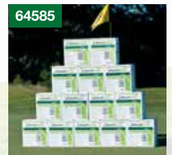
64585 Contact Action Solution